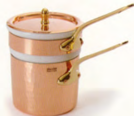
bain marie preparing sauces, custards, gentle heating