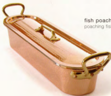
fish poacher with lid poaching fish