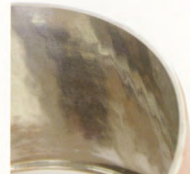
Copper with tin interior

for cooking everyday and specialty tinned pieces