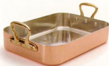
roaster roast meats, poultry and vegetables