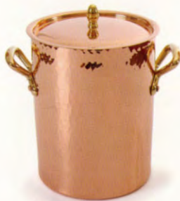
soup cooking pot with lid preparing soup, stocks, cooking corn...