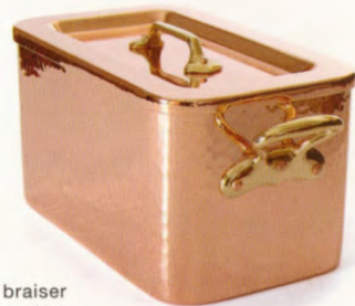
rectangular braiser braising, slow-cooking stews