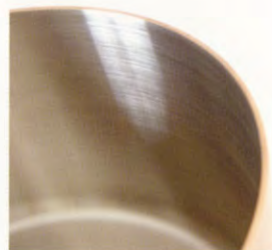
Copper with stainless steel interior