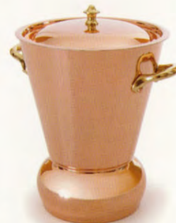
potato steamer with lid steaming potatoes and other vegetables